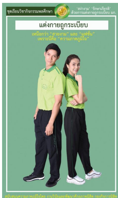
Figure 4 Physical Education Activity Uniform