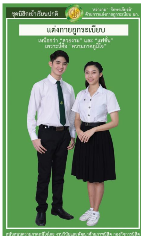
Figure 2 Regular Student Uniform / Regular Class Attire