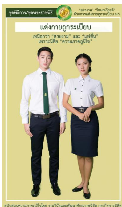
Figure 3 Ceremonial Student Uniform / Royal Ceremony Attire